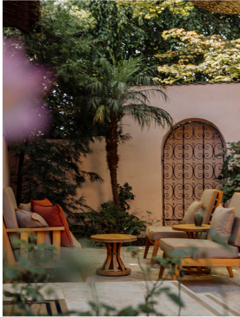
A romantic hideaway for two