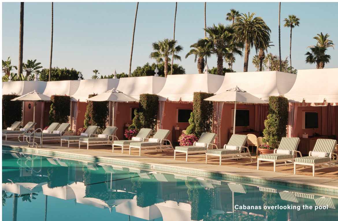
Cabanas overlooking the pool

The two spectacular Presidential 'ultra' Bungalows are the most prestigious presidential suites in Los Angeles. Each three-bedroom bungalow blends the indoor and outdoor experience effortlessly through 464m 2 /5,000ft 2 of living space. They feature a spacious great room with 4m/12ft cottage-style ceiling, chef's kitchen, expansive outdoor living area, outdoor fireplace and shower, and a wall of floor-to-ceiling glass doors overlooking a private infinity plunge pool.