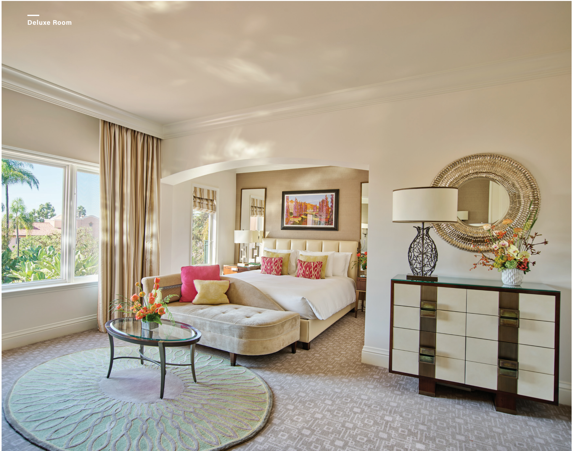
— Deluxe Room