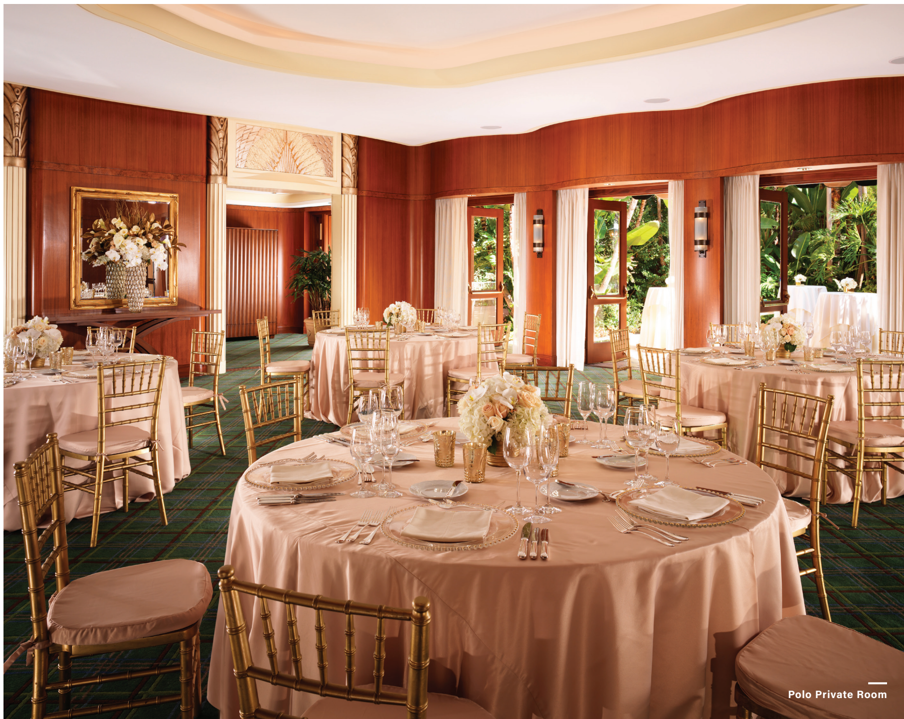
Polo Private Room